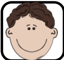
MARK - 7