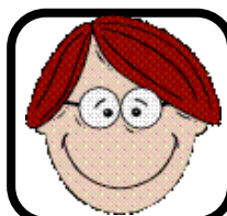
TIM - 19