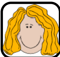
LYN - 18