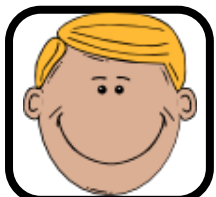
SAM - 19